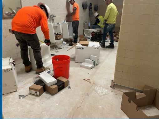
Remaining Plumbing Fixtures Installed