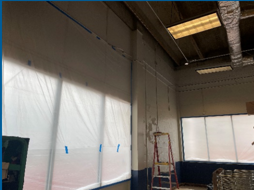
Cafeteria being prepped for Prime/First coat paint