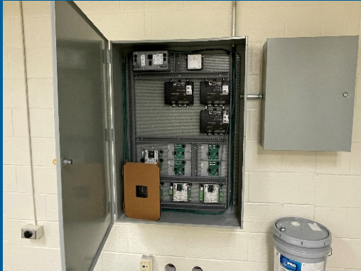
HVAC control panels installed