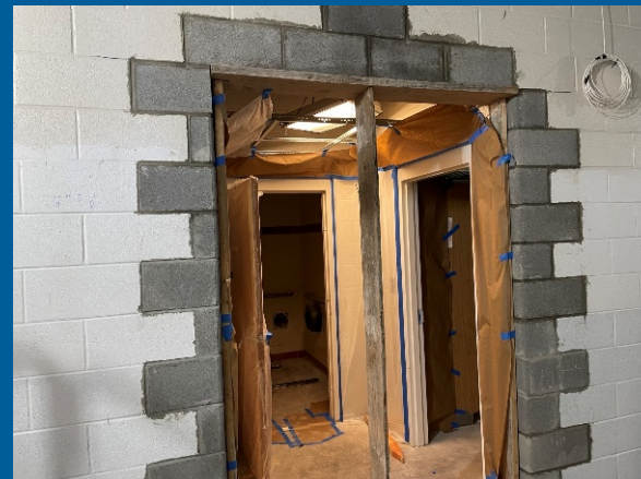
New Cased Opening at Area D-West