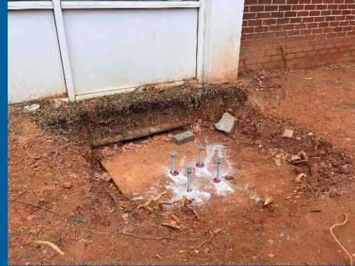
Epoxied Anchors Installed For Metal Canopy