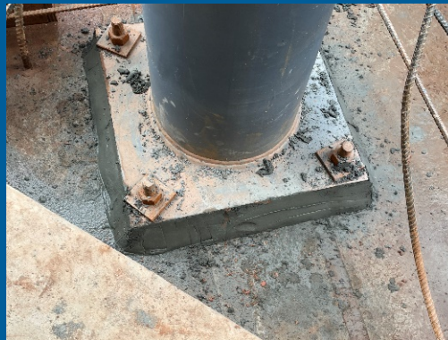
Packed Grout at column base plate